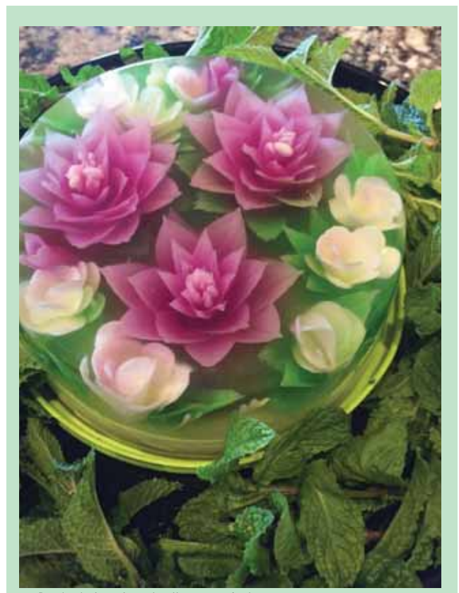
A floral salad made with Jell-O is a refreshing summer treat.